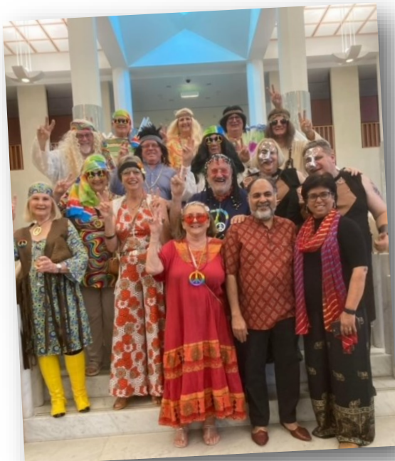
Club members dressed for the theme 'Through the Ages' at the Gala Dinner in Parliament House

However, one important takeaway is to encourage even more members of the Club to consider attending next year's Conference, which will be held within a reasonable driving distance, in the city of Warrnambool.